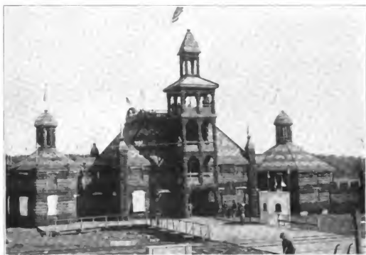
FLAX PALACE, FOREST CITY, 1892